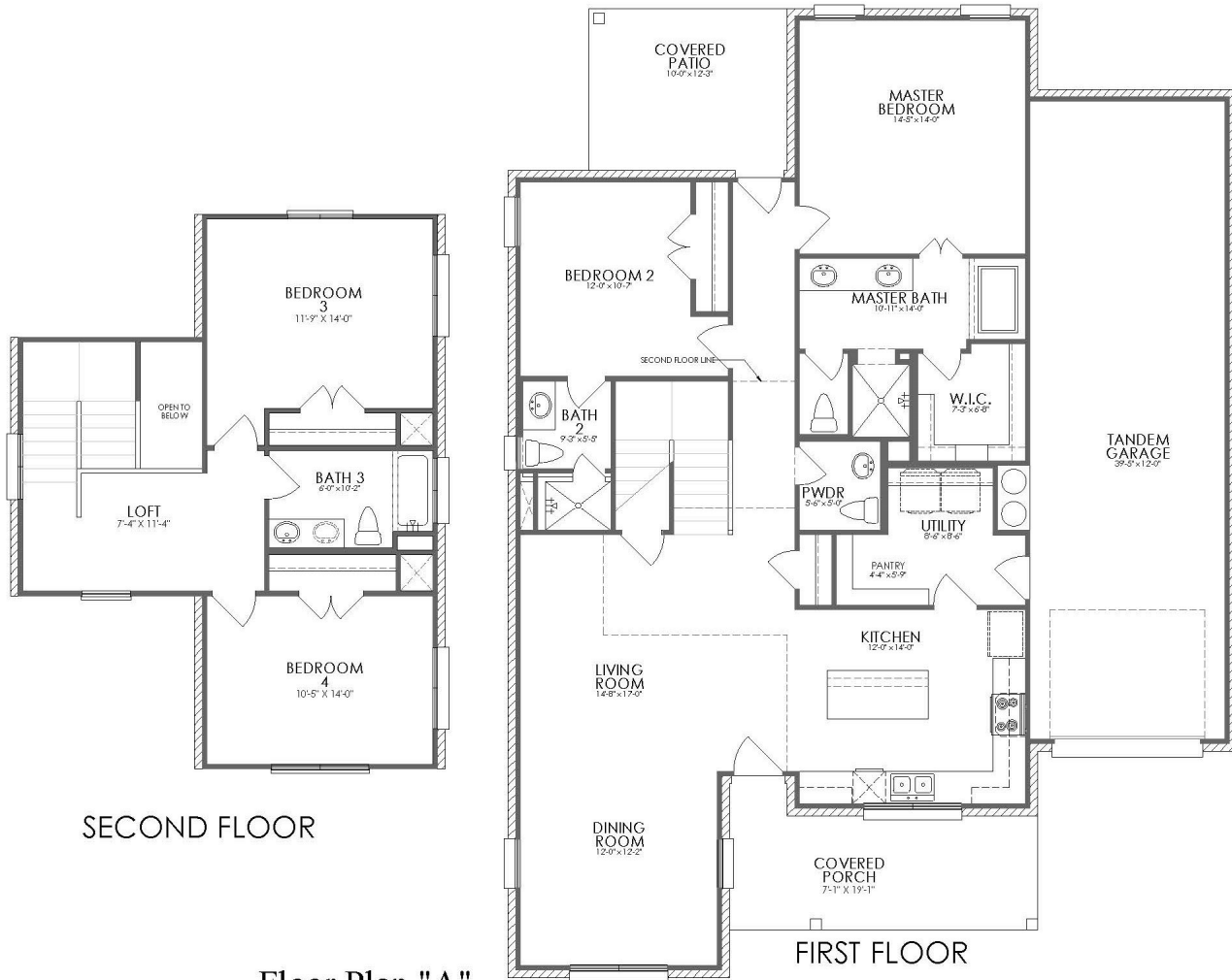
Floor Plan "A"